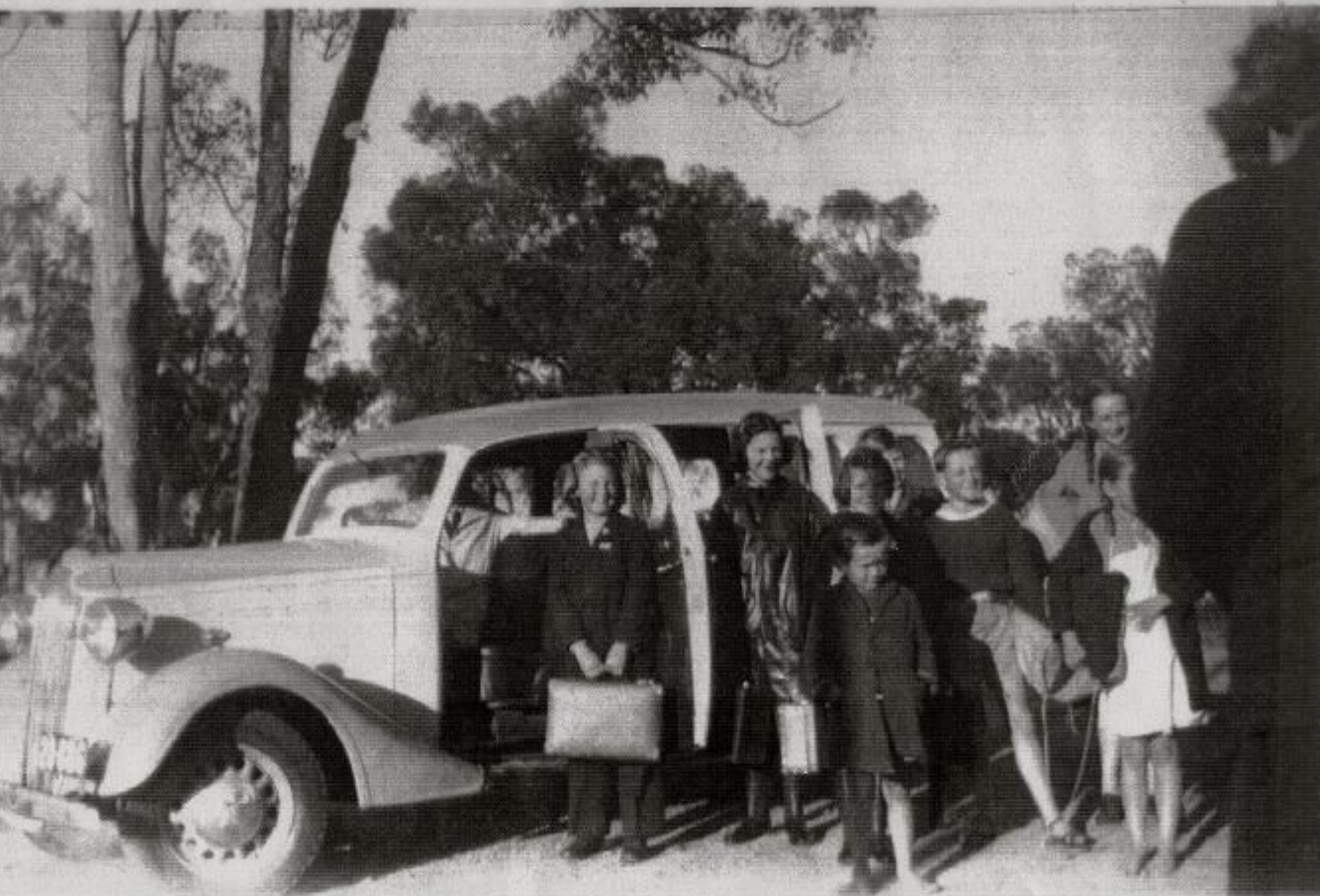
Y OF BULLSBROOK JUNIOR HIGH SCHOOL AUGUST 1952 LD BULLSBROOK BUS RUN